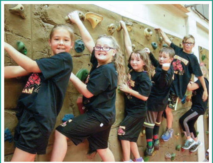
Climbing the walls at Evergreen School in Kalispell: a fitness and health program for kids and their parents, funded in part by a Karen Cox Memorial Grant. More about the grants on page 3.