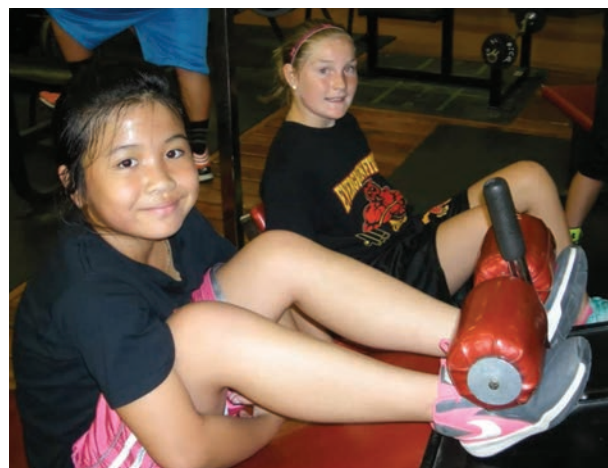
Building the MPTF endowment means we can support more innovative public school projects like the Evergreen Fitness Team in Kalispell, fighting obesity and teaching healthy habits to students and their families.

Not one penny of the endowment itself may be spent.